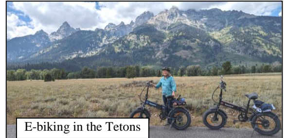
E-biking in the Tetons