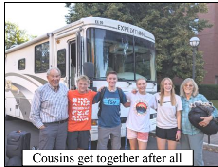
Cousins get together after all