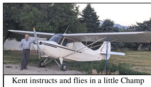
Kent instructs and flies in a little Champ