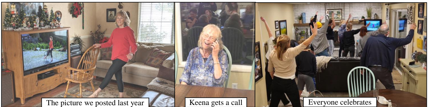
The picture we posted last year