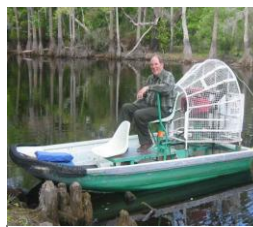
Swampboating in Florida