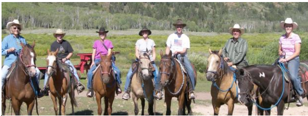
The Dudes of the Dude Ranch - Mom, Dad, and all five kids on the trail....