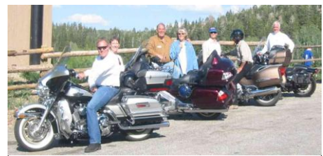
Cycling through Utah's Mountains